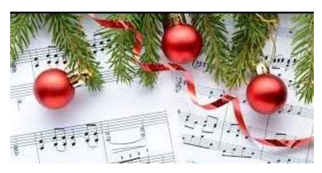
Plymouth Christmas Show

Saturday 19th November Plymouth Guildhall